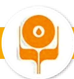
Nagpur Nagirk Sahakari Bank Ltd