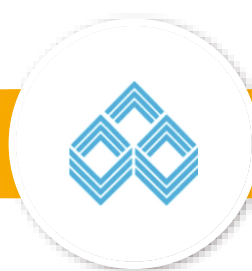
Indian Overseas Bank